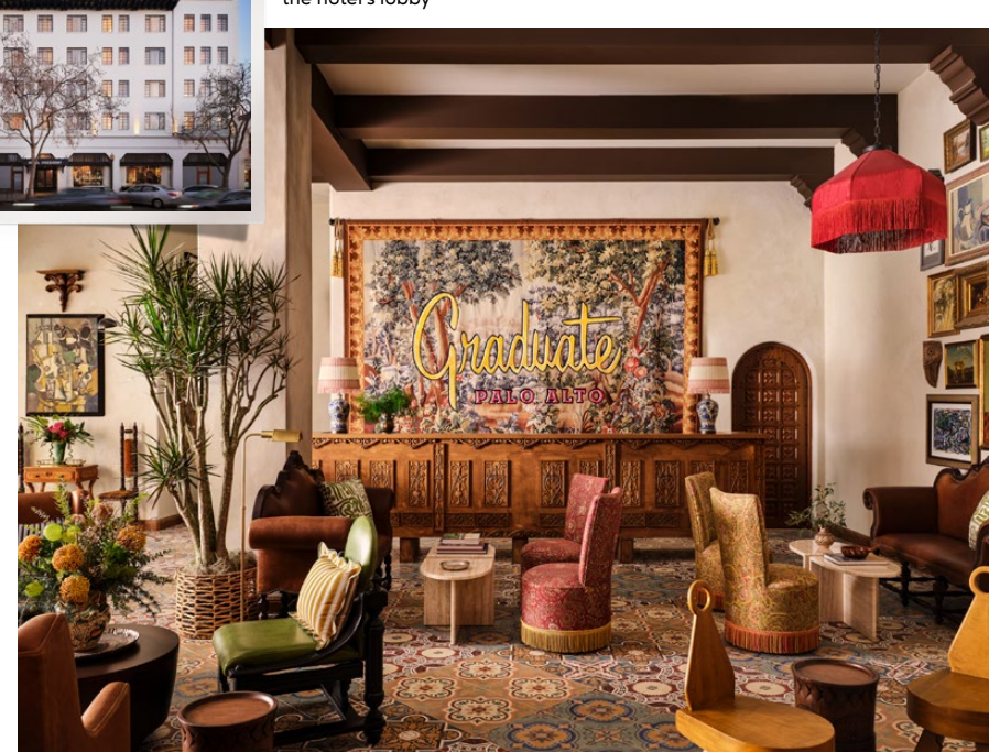
ROM LEFT The Graduate Palo Alto; the hotel's lobby